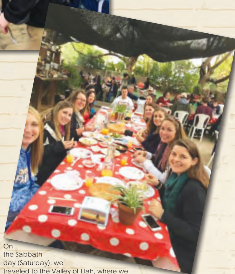
On the Sabbath day (Saturday), we traveled to the Valley of Elah, where we each collected five smooth stones as David did when he slew Goliath there. Afterward, our driver took us to his moshav, or community, where a neighbor fed us the best pita, hummus, shakshuka, and salad that we had the whole trip. Notice the clean plates!