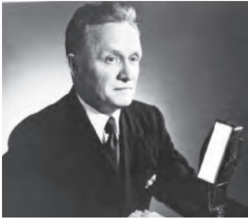
Rev. Dr. Walter A. Maier (pictured here, circa 1935–1940) was one of the renowned evangelists of the mid-20th century.