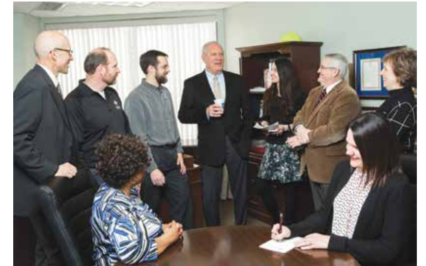
Leaders from the CUAA campus gather each week to connect and update one another on important campus happenings.

A successful organizational culture is dependent upon good communication. We have many passionate leaders on the CUAA campus who are accomplishing great things, but if each of those leaders acted outside of the knowledge and cooperation of others on campus we would not be seeing the incredible growth that we’ve been seeing at Concordia over the past few years. Communication has been a key part of our campus’ success, and we work hard to engage in ongoing, effective communication with each other.