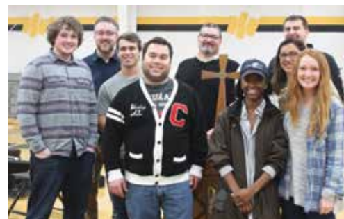
The CUAA Worship Arts team helps Lutheran High North in Michigan kick off its 2018 National Lutheran Schools Week celebration in January.