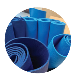
Student-athletes and health occupations majors received free exercise mats and reflection journals this semester as an incentive to participate in classes that taught coping strategies and resiliency mindsets. The effort is funded by a grant from CIRG.