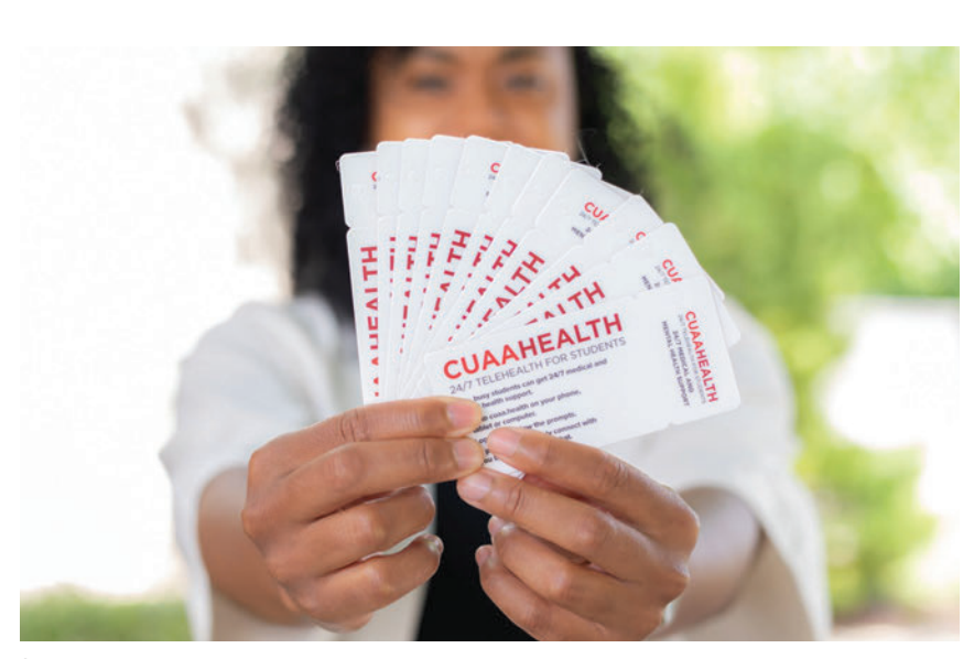
Students received CUAA Health kevchain tags at the start of the semester. The tags serve as a handy reference for how to access 24/7 health services

ind, body, and spirit. The pandemic attacked all three, yet Concordia employees have nimbly shifted to reinforce the university's holistic approach to educating, nurturing, and equipping its students.