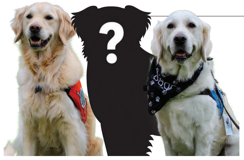
Concordia currently owns two purebred Golden Retrievers, Zoey (left) and Sage. It will look to add a third to its Comfort Dog Ministry team in August 2021.