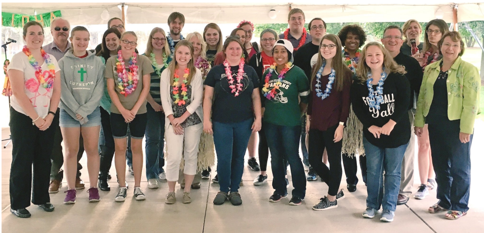
School of Education students at the 2017 Back-To-School Luau