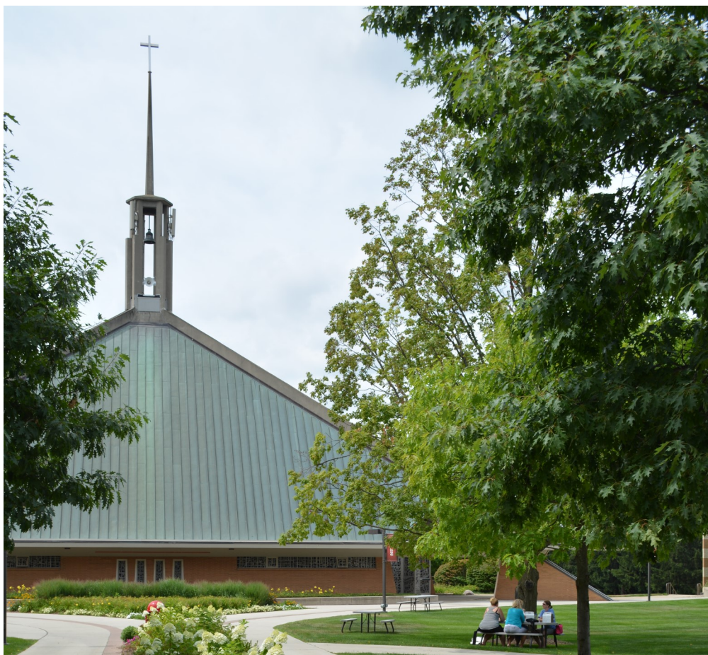
Teachers eating lunch together on the CUAA campus during Summer Institute Workshops